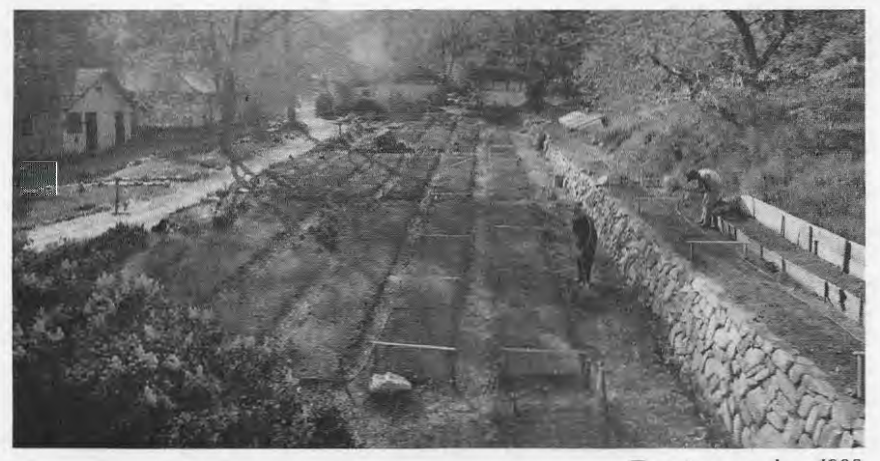
Tassajara garden, 1988

This is a very good interpretation of reality, and a good suggestion of how we practice our way, and of what kind of activity is going on in our everyday life. With this line the interpretation of reality from the light of independency is finished.