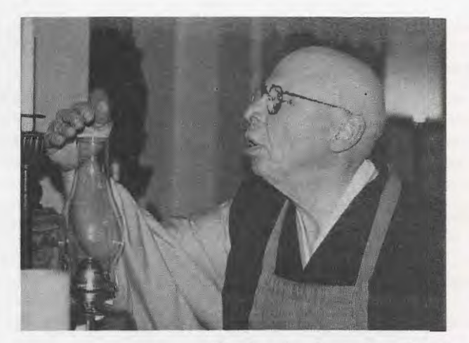
Tending the altar at Page Street

On the other hand, there is a place for talking. We are speaking animals. But here, there is a time for talking and a time when we observe silence. Yesterday I was walking through Tassajara; it was afternoon and it was work period and people