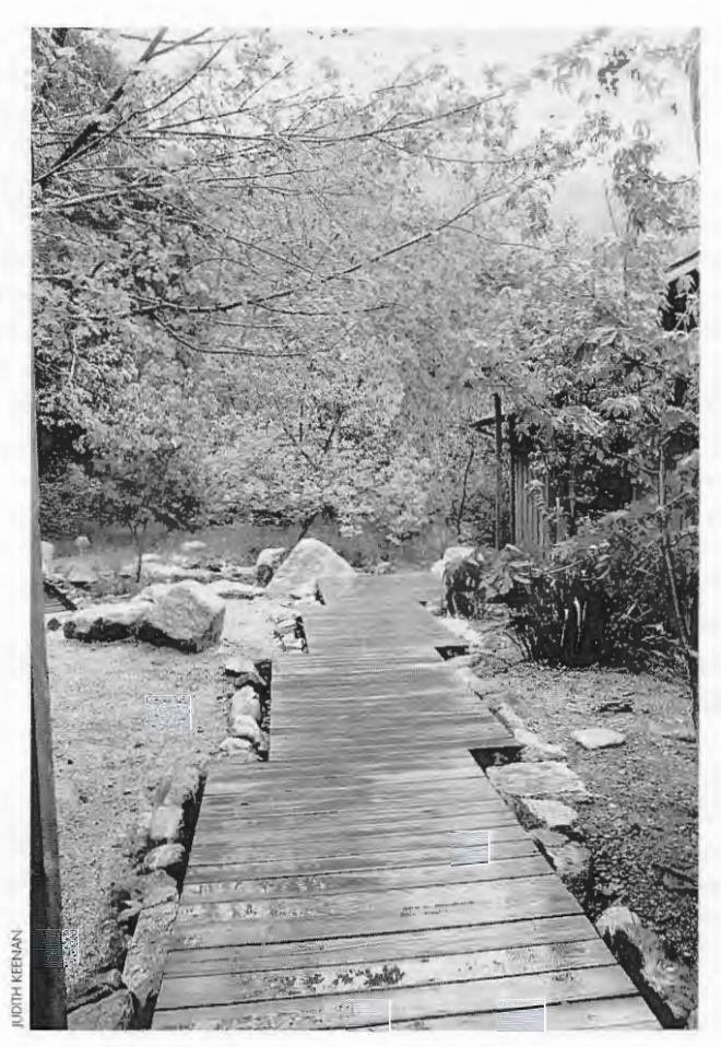
Path to the bathhouse at Tassajara