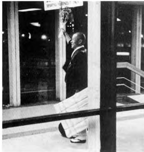
Shunryu Suzuki at gate waving goodbye.